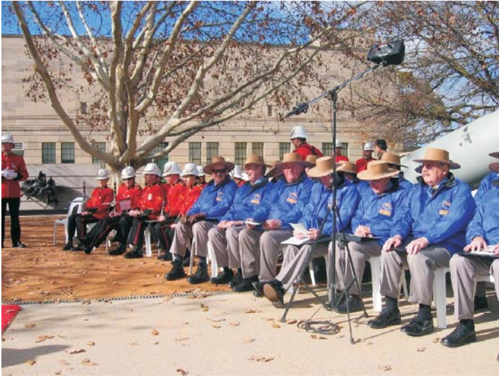
RMC Band and Australian Rugby Choir